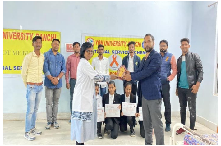
Certificate and memento distribution of Blood Donation camp