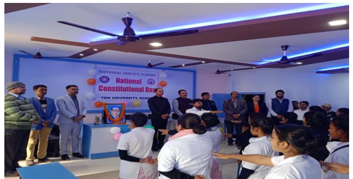
Oath ceremony on constitution day