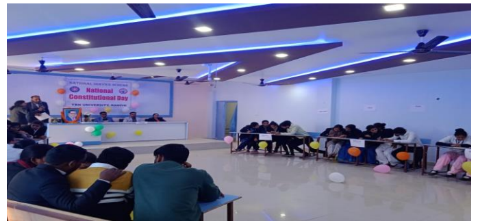
Quiz competition on constitution day